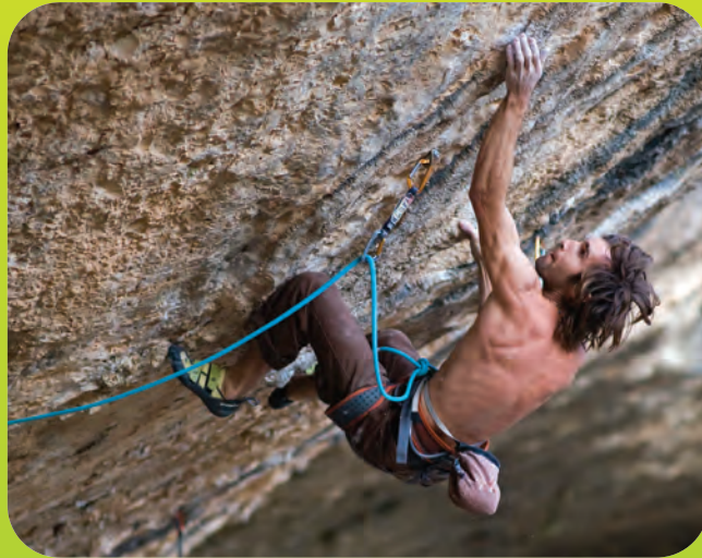
Chris Sharma on the First Round First Minute 5.15b, Margalef, Spain.